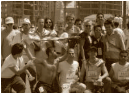
Helem at the April 13, 2005 Run for Unity commemorating the 30th Anniversary of the Lebanese Civil War.

At first glance, Astraea grantee partners may appear to be worlds apart. Languages, cultures, oceans, and political climates separate them. They employ different strategies and tackle different challenges, but upon closer inspection, their goals are one and the same: ensuring justice, safety, and freedom for all. Facing ever-present resource, political, and physical challenges, activists persevere — transforming communities and changing people’s lives. There are hundreds of stories that reflect the accomplishments of organizations that Astraea has supported over time. Here is a snapshot of just a few of the remarkable changes that have unfolded this past year.