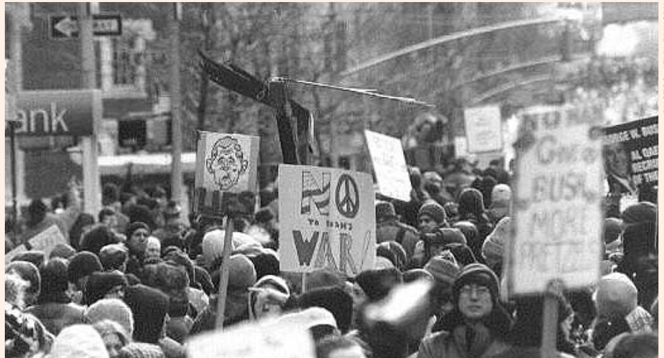
Protestors on First Avenue at the February 15th Anti-War Demonstration in New York City

I believe, however, that many of us have not so much been sleeping as we have been preparing and grappling with new ways to address complex problems. Lifting our collective voice in street protests is one of a multitude of strategies we need for lasting change to be sustained. And, like many other progressive foundations, nonprofits and activist organizations, Astraea continues to explore ways to best identify, support and sustain movement—building efforts that promote justice.