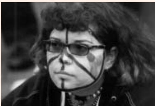
Peace activist in Union Square, New York City