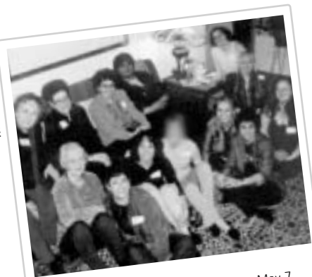
Astraea Board member and host of the May 7, 2003, Astraea Circle of Friends Member Briefing, surrounded by her guests