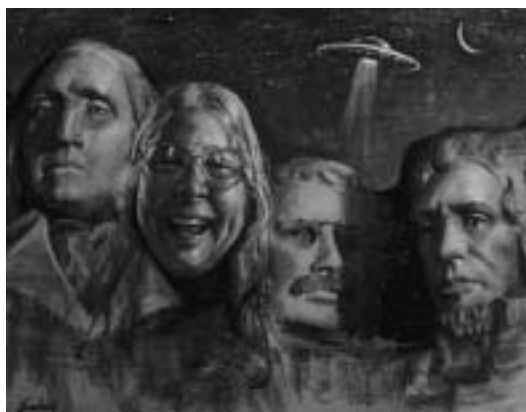
The Alien, Pastel, 2002.